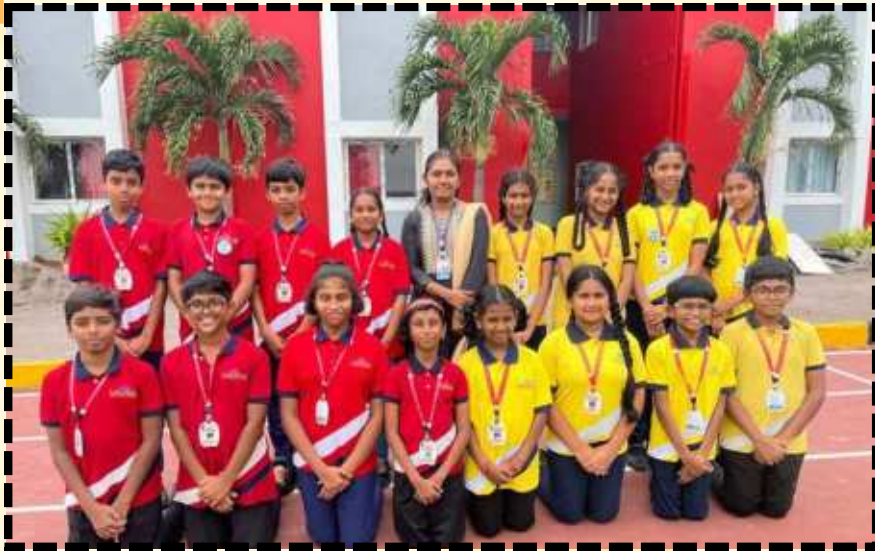
Best organised class

The Star Awards at Laurus The Universal School honor excellence with categories like Best Organized Class, Best Disciplinary Class, School Spirit Award and the Champion Crest Award, celebrating outstanding teamwork and