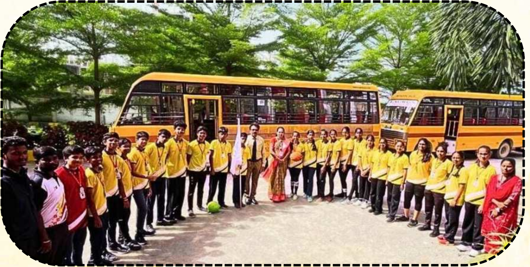
School spirit Award