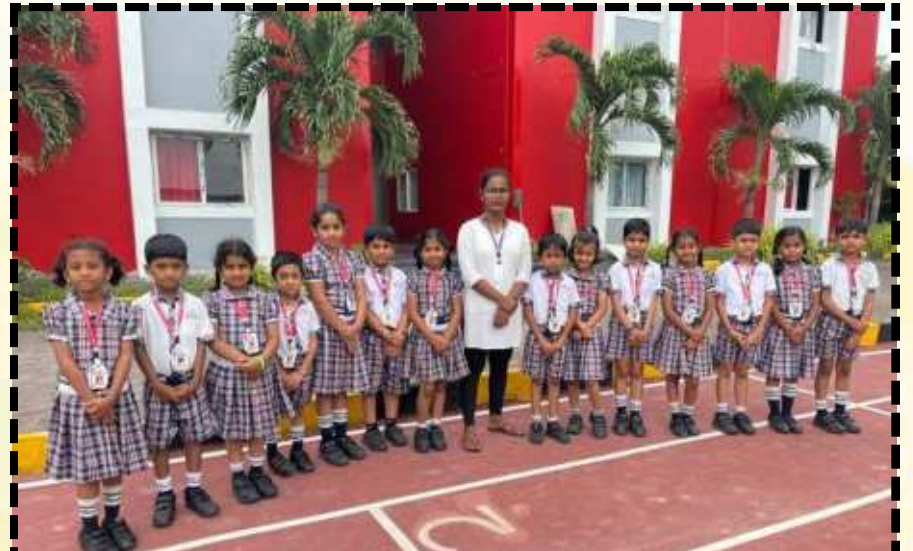
Best Disciplined class