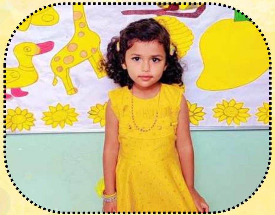
Little Star Award